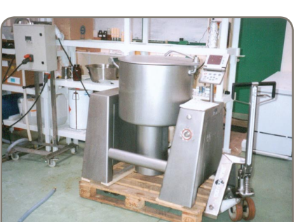
RF-PLUS - for the food industry and the pharmaceutical industry with strict hygiene and sanitation requirements.