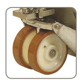
Wheels with rubber-sealed

Please ask for specification details or visit our website www.logitrans.com. We also offer tailor-made solutions.