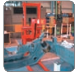
Available with side-tilting forks and/or optional extras, e.g. crane arm, drum turner, remote control, level control, built-in charger.