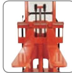
Adjustable forks are available as optional extra in many different lengths and types.