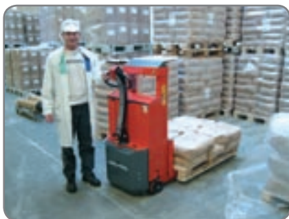
Optimum safety through transparent and impact-resistant safety screen and reduced driving speed in raised position.