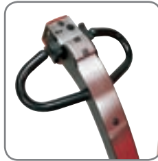
Possible to operate with the handle upright. Central location of all control buttons.

Strong construction ensures a long operating life and low maintenance costs.